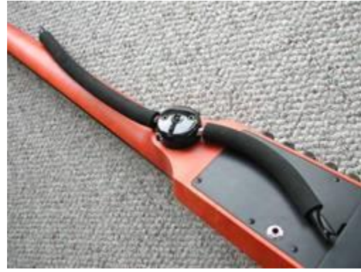
Folded for Storage For storage, move the long arm toward the neck, and rotate the short arm back over the body