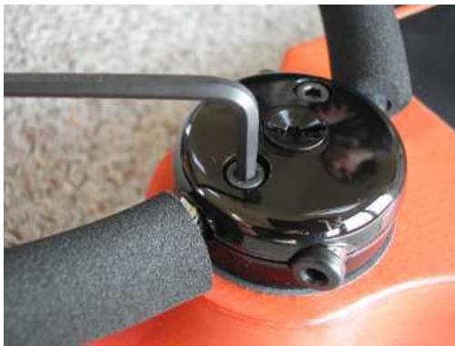
Adjusting Long Arm Friction

To adjust the arm friction, tighten or loosen the two hex screws in the hub. The screw closest to the long arm should generally be tightened more than the other screw, to provide more friction on the long arm. The hex wrench can be stored in the hole in the ends of the tubes, but care must be taken to insure that the hex wrench is not positioned where it will scratch the instrument when the arms are moved.