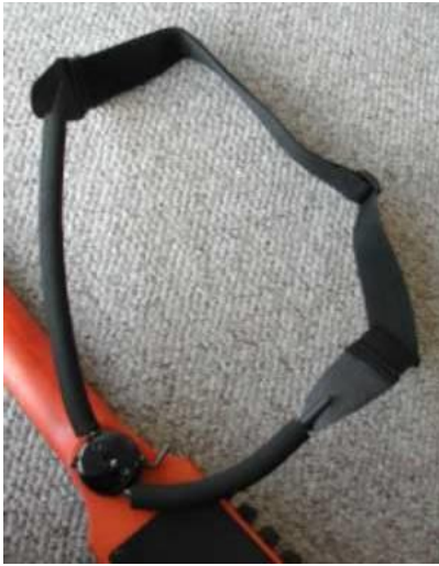
Arms in Playing Position