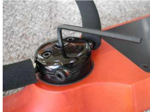
Adjusting Pivot Friction

The large, thin washer should be placed between the instrument and the hub (failure to use the washer can damage the surface of the instrument). Insert the attachment screw into the threaded insert on the back of the instrument. Use a 4 mm hex wrench, flat screwdriver, or coin to tighten the screw. The hub should be held firmly but still be able to rotate.